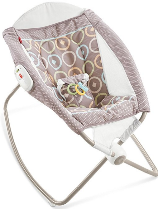
Above: Figure 4