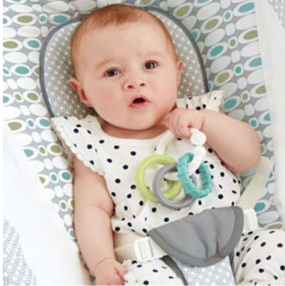
Above: Figure 3