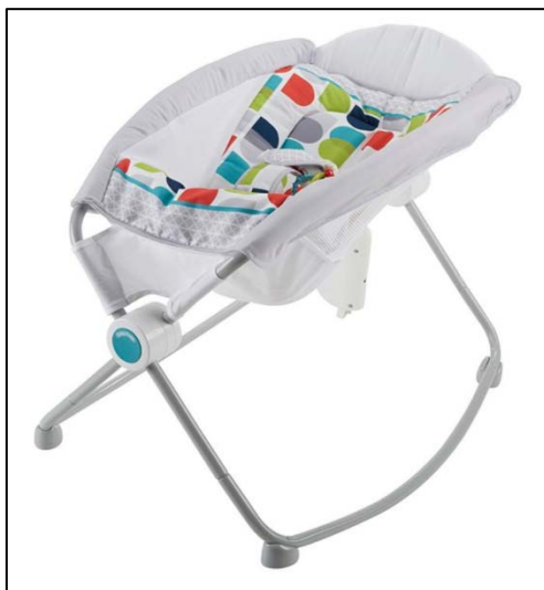
Above: Figure 1

the hammock that is covered with soft padded material (Figures 4 and 5) on which the baby is placed. Different views of the product are shown below: