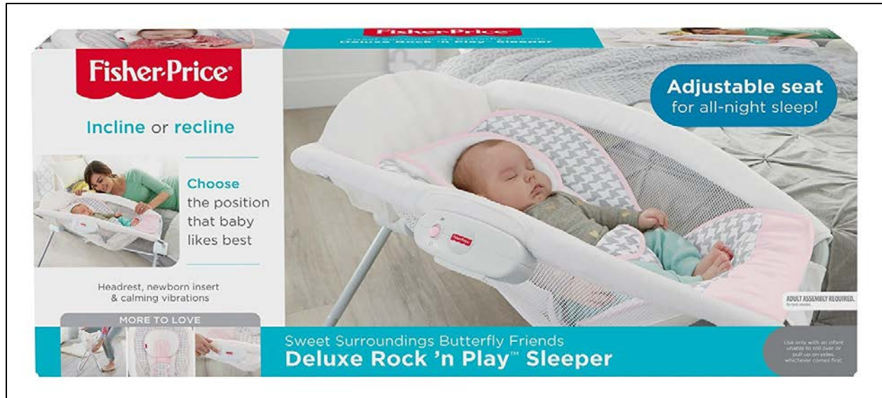
Above: Figure 8

99. The marketing statements on the packaging conflict with the AAP’s guidelines and recommendations, and those of other infant sleep experts.