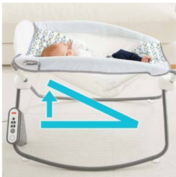
Above: Figure 2