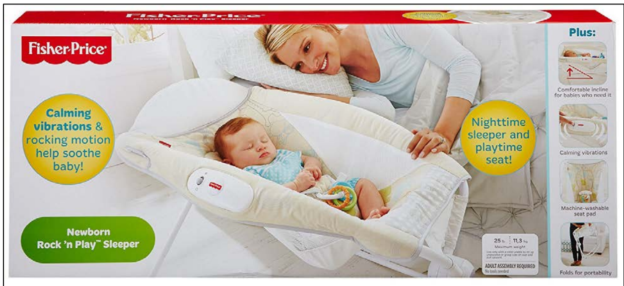
Above: Figure 7