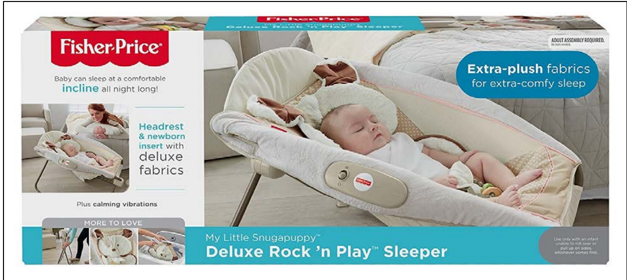
Above: Figure 6